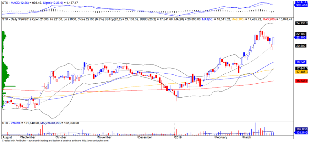
STK 股票的價格走勢圖