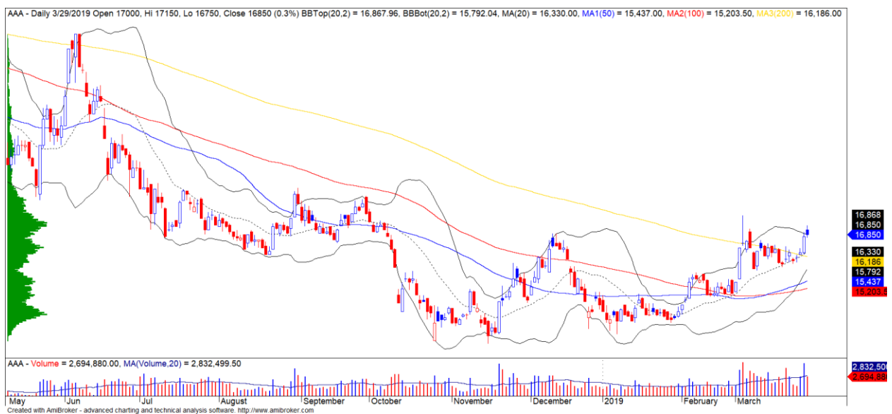
AAA 股票的價格走勢圖