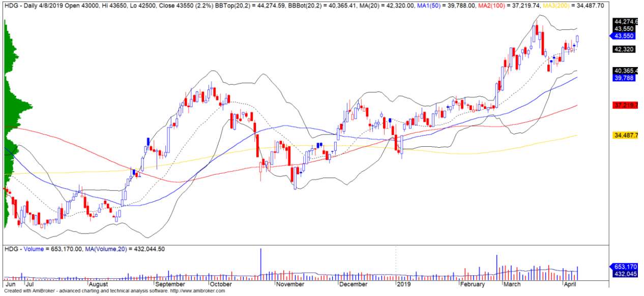
HDG 股票的價格走勢圖