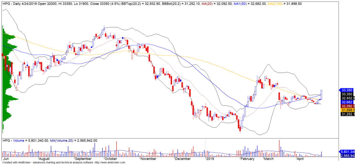
HPG 股票的價格走勢圖