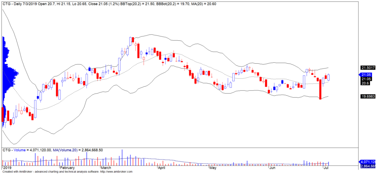
CTG 股票的價格走勢圖