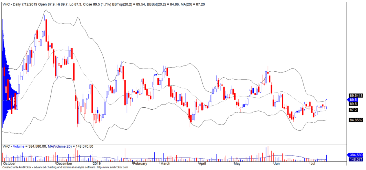
VHC 股票的價格走勢圖

(* 股票評級 Stock Rating 是企業股票價格基本增長與相對強弱與越南股市三大證交所剩餘股票相比的相關性比較。