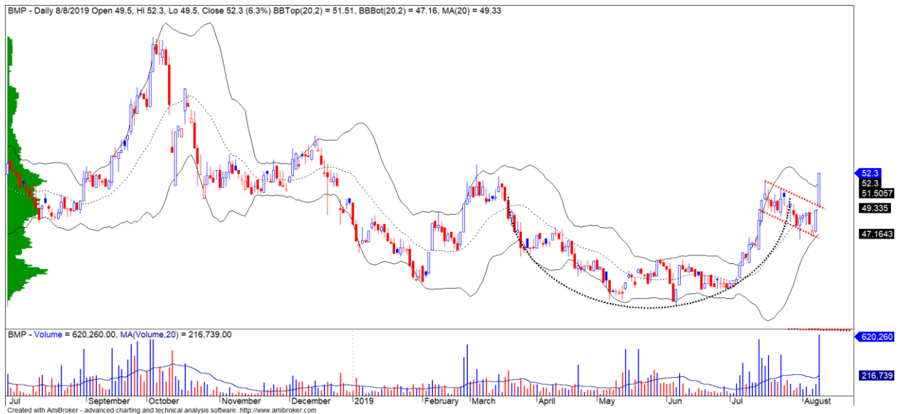
BMP 股票的價格走勢圖

(*) 股票評級 Stock Rating 是企業股票價格基本增長與相對強弱與越南股市三大證交所剩餘股票相比的相關性比較。