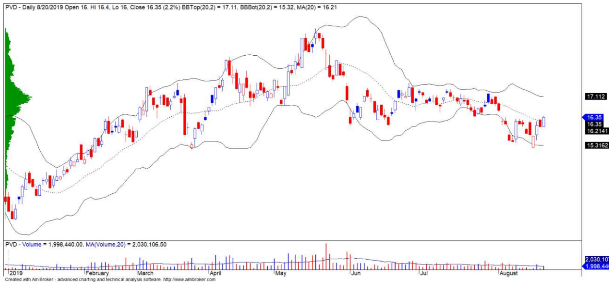
PVD 股票的價格走勢圖

(*) 股票評級 Stock Rating 是企業股票價格基本增長與相對強弱與越南股市三大證交所剩餘股票相比的相關性比較。