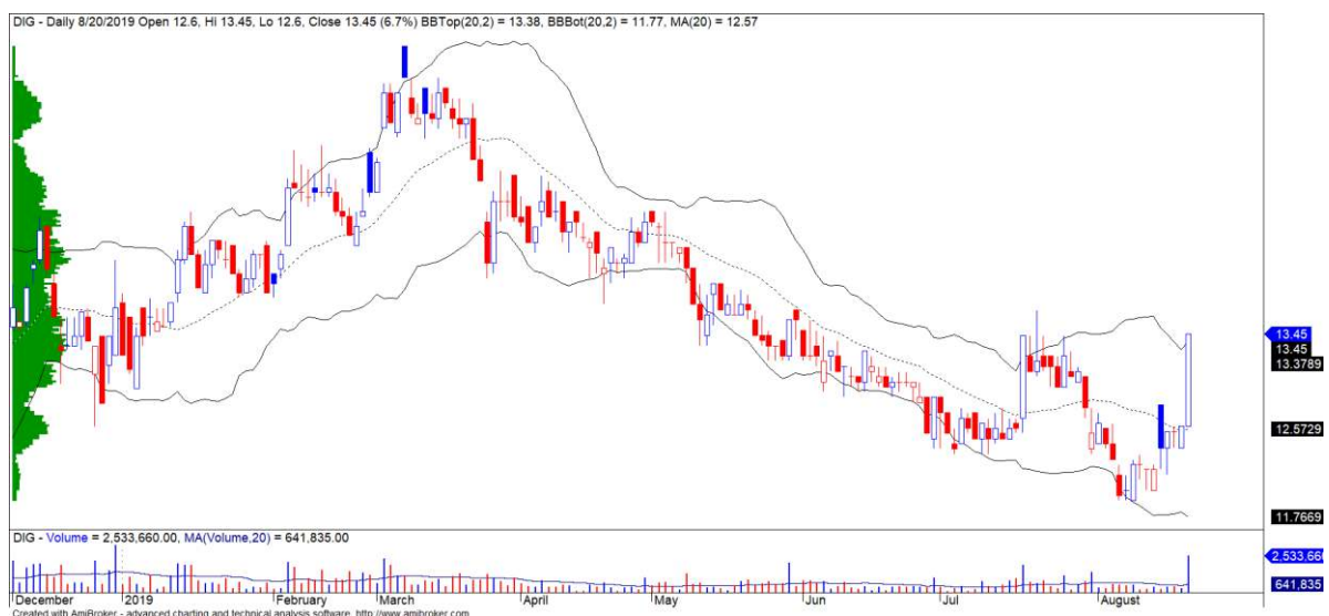
DIG 股票的價格走勢圖