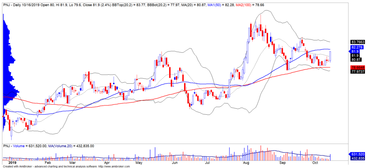
PNJ 股票的價格走勢圖

(* ) 股票評級 Stock Rating 是企業股票價格基本增長與相對強弱與越南股市三大交易市場剩餘股票相比的相關性比較。