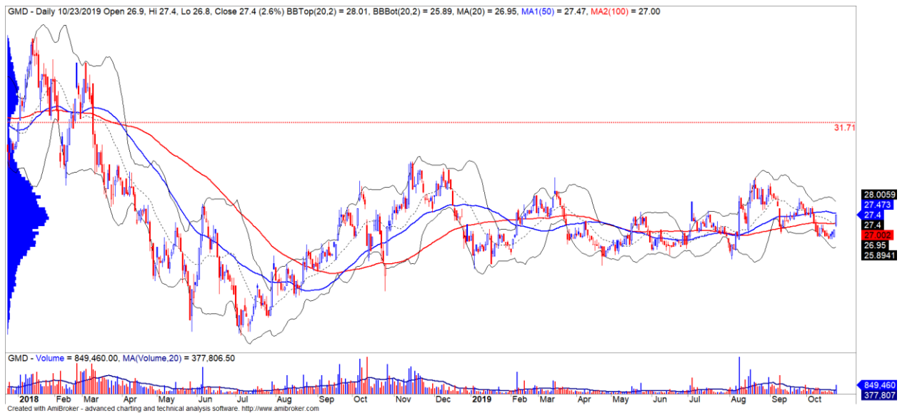
GMD 股票的價格走勢圖

(* 股票評級 Stock Rating 是企業股票價格基本增長與相對強弱與越南股市三大交易市場剩餘股票相比的相關性比較。