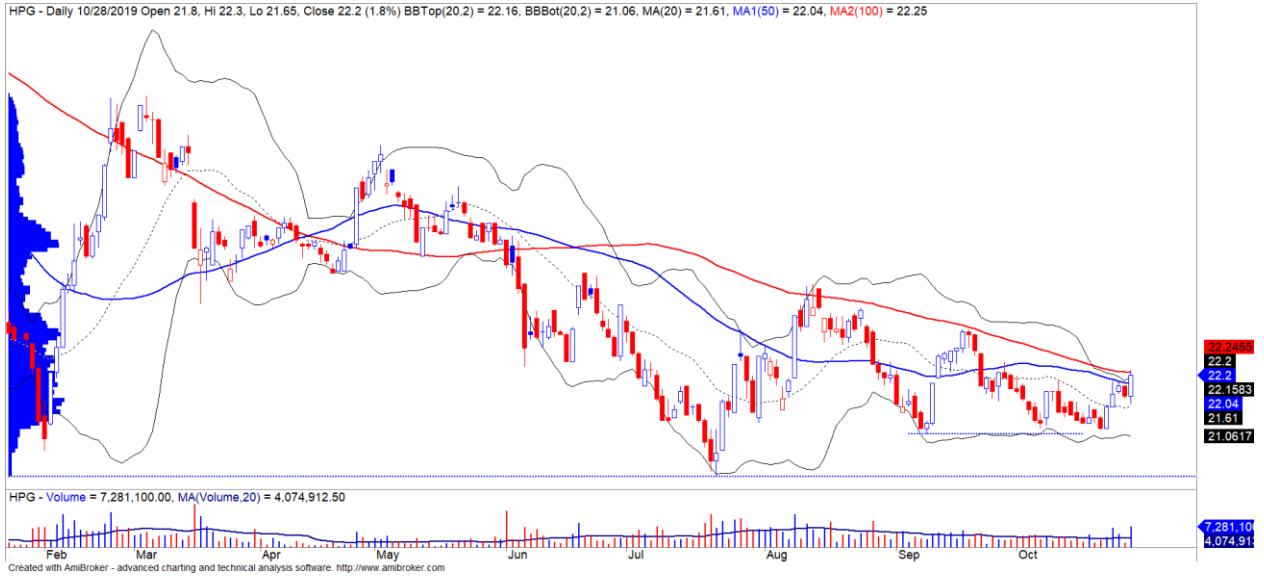
HPG 股票的價格走勢圖

(*) 股票評級 Stock Rating 是企業股票價格基本增長與相對強弱與越南股市三大交易市場剩餘股票相比的相關性比較。