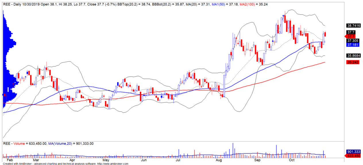
REE 股票的價格走勢圖