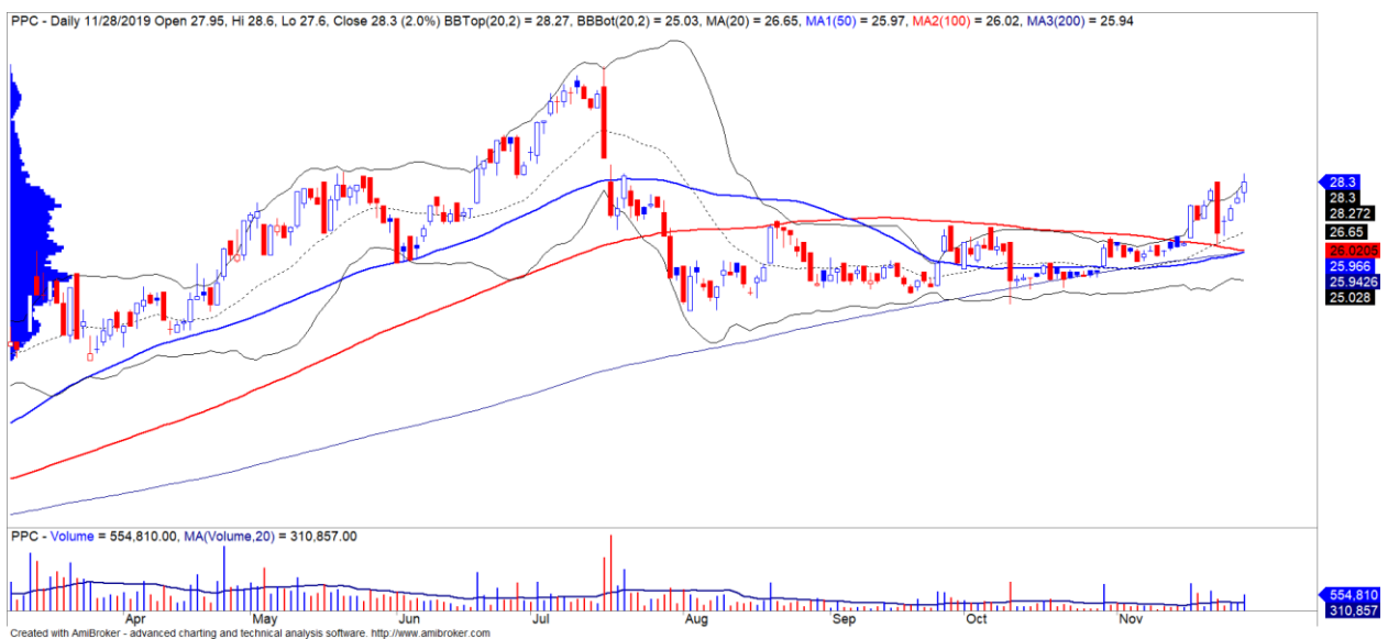
PPC 股票的價格走勢圖