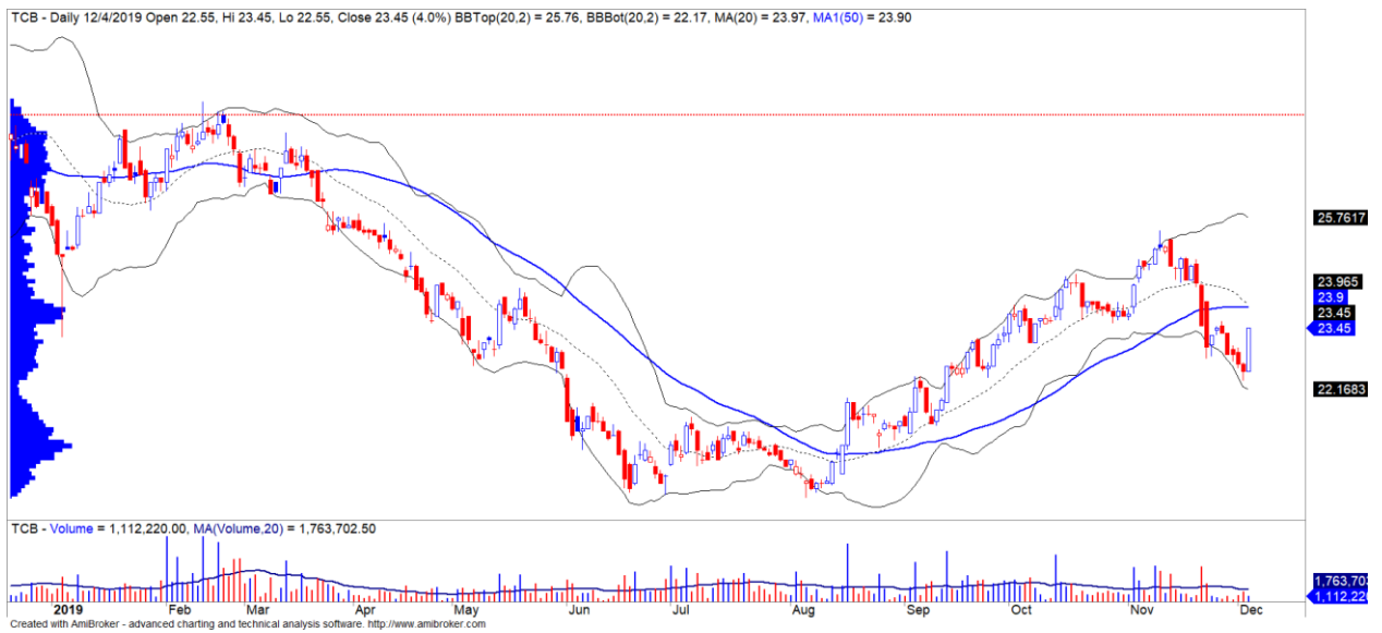
TCB 股票的價格走勢圖

(*) 股票評級 Stock Rating 是企業股票價格基本增長與相對強弱與越南股市三大交易市場剩餘股票相比的相關性比較。