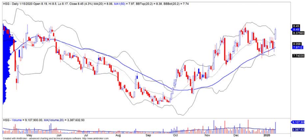
HSG 股票的價格走勢圖

(* )股票評級 Stock Rating 是企業股票價格基本增長與相對強弱與越南股市三大交易市場剩餘股票相比的相關性比較。想了解更多上市公司的股票水平有關的更多信息，請按下以下鏈接：