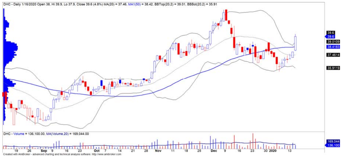
DHC 股票的價格走勢圖

(*)股票評級 Stock Rating 是企業股票價格基本增長與相對強弱與越南股市三大交易市場剩餘股票相比的相關性比較。想了解更多上市公司的股票水平有關的更多信息，請按下以下鏈接：