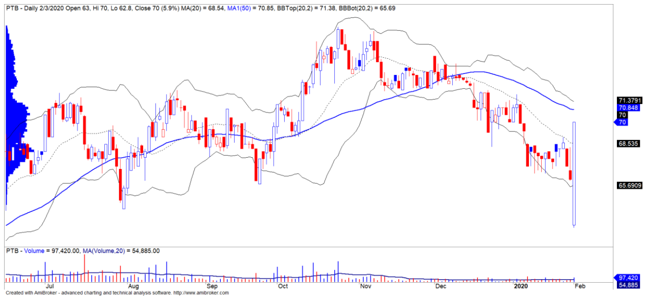
PTB 股票的價格走勢圖

(* ) 股票評級 Stock Rating 是企業股票價格基本增長與相對強弱與越南股市三大交易市場剩餘股票相比的相關性比較。想了解其他上市公司的股票水平有關的更多信息，請按下以下鏈接：